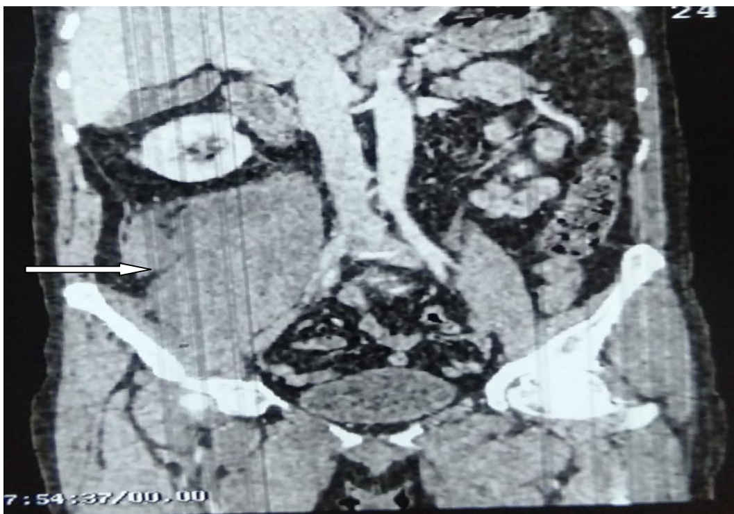
Image 3. Swollen appearance of the right psoas muscle in its iliac portion with hematoma