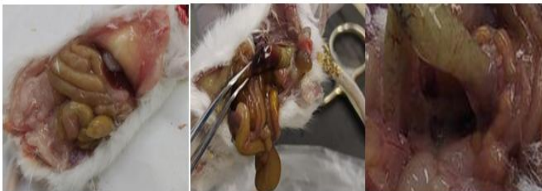
Fig. 3. The state of the intestines of experimental animals (mice) with ulcerative colitis

Normally, the largest number of lactobacilli , including Lactobacillus casei and Lactobacillus plantarum , is found in the large intestine. Directly contacting with enterocytes, lactobacilli stimulate the defense mechanisms of the human body, including an increase in the rate of regeneration of the mucous membrane, activate phagocytosis, as well as the synthesis of lysozyme, interferons, and cytokines [7,4,24]. Local inflammation and wound healing are associated not only with the influx of leukocytes - neutrophils, macrophages, lymphocytes, mast cells - into the wound focus but also with a properly selected complex therapy of various strains of lactobacilli. Apparently, for the successful resolution of inflammation and, ultimately, wound healing, the balance between stimulating and inhibiting factors in the wound focus is of great importance.