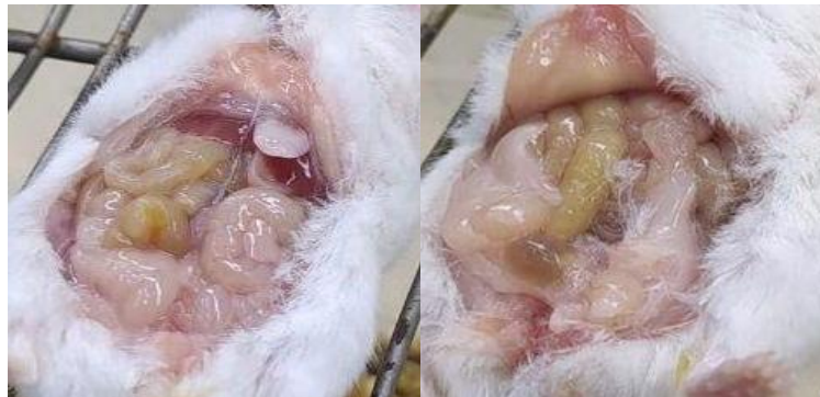
Fig. 4. The state of the intestines of experimental animals after treatment with lactobacilli (treatment for 10 days)